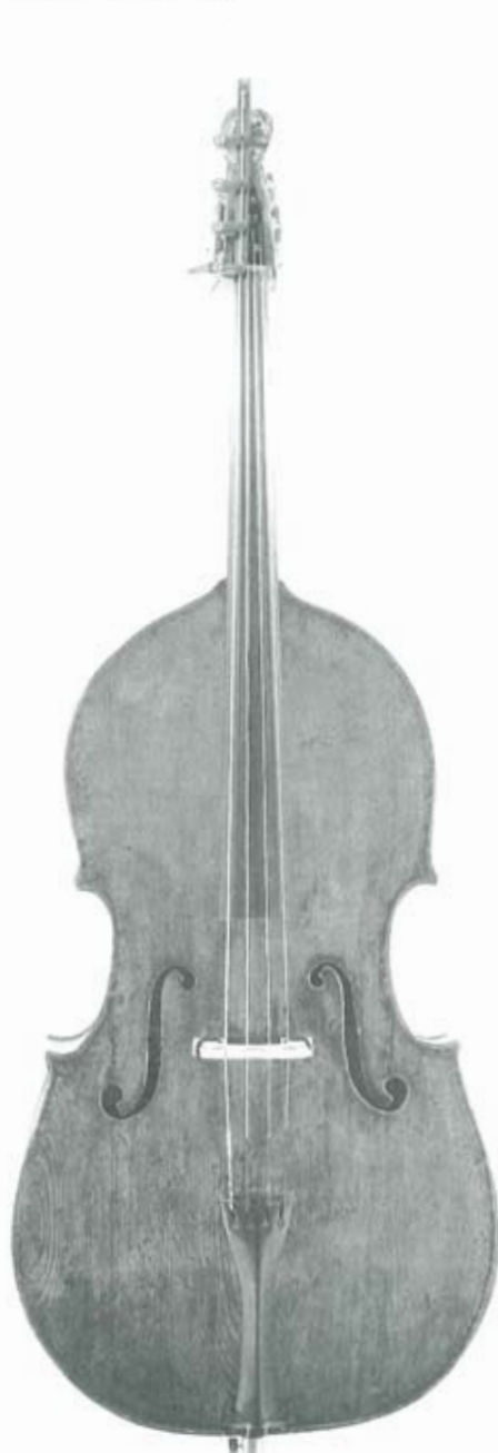
Full-length view from the front