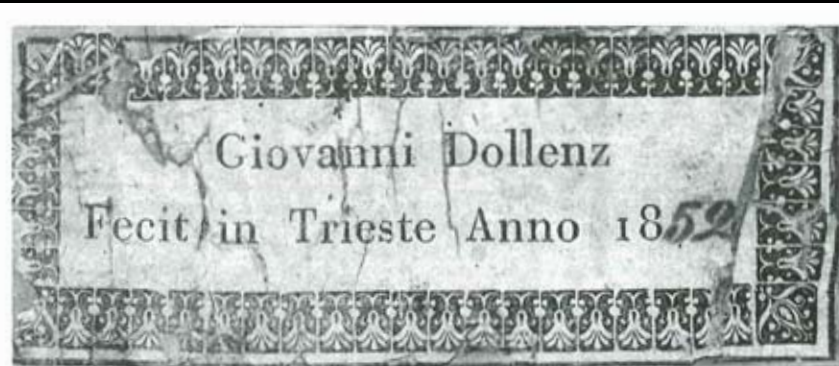
The Dollenz Label, dated 1852