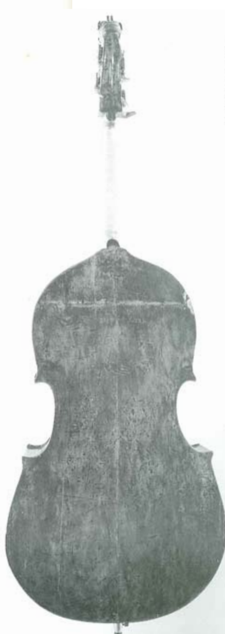
Full-length view from the back