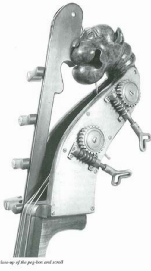
A close-up of the peg-box and scroll