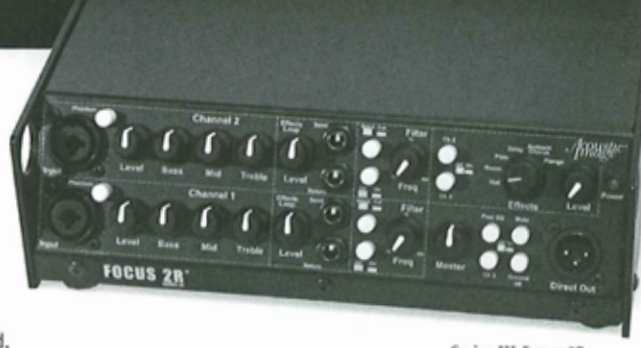
Series III Focus 2R 800W from 4.5 lbs

Even lighter weight, with a heavy array of features and unmatched transparent sound.